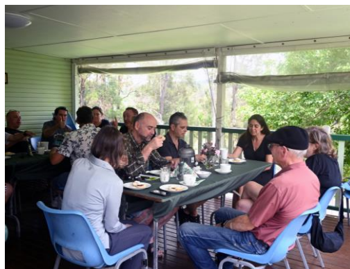
Permanent Rail Association