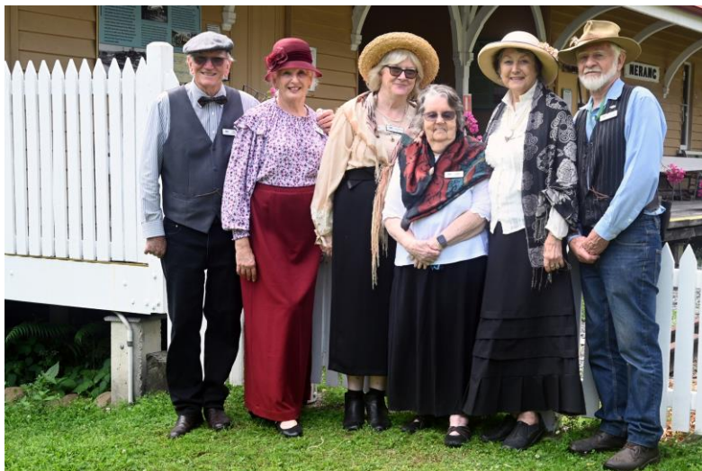
Volunteers Senior's Day