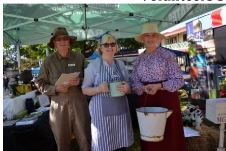
Mudgeeraba Street Party Skillling Qld Graduation